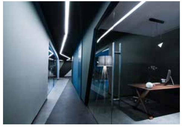
The office walls and doors utilise floor-to-ceiling glass which allows interesting reflections from the integrated corridor lighting.

Lines dart across the walls, floors and ceiling to create irregular shapes and shadows